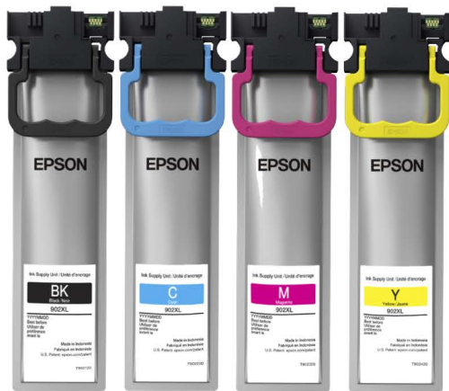
T902 DURABrite® Ultra Series Genuine Epson® Ink initial packs 1

Printer designed for use exclusively with Epson Ink packs*.